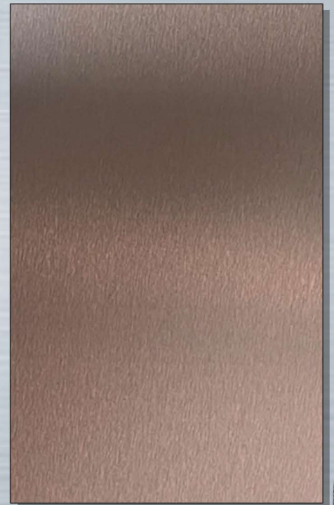
VC-44 No.4 Brown+Shiny AFP