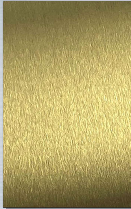
VC-34 No.4 Gold+Shiny AFP