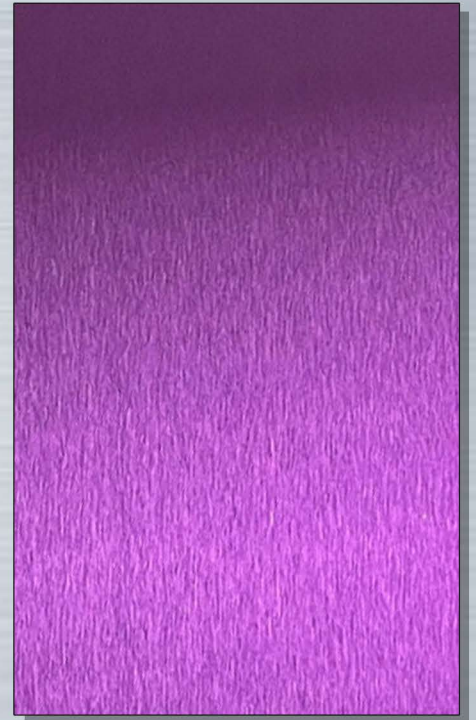
VC-41 No.4 Pink+Shiny AFP