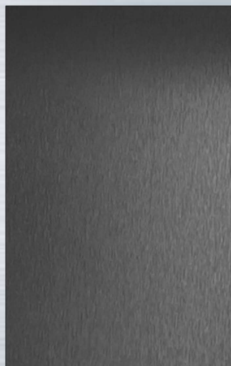
VC-48 No.4 Pvd Black+ Shiny AFP