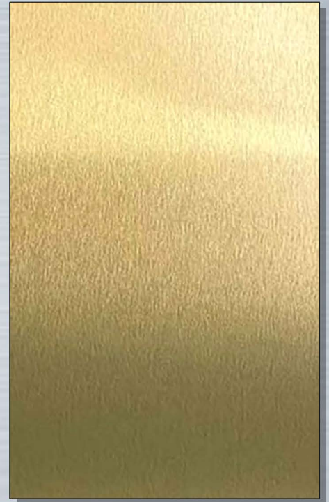
VC-35 No.4 Champagne Gold+Shiny AFP