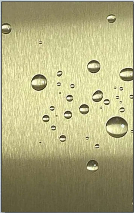
VC-36 No.4 Bronze+Shiny AFP