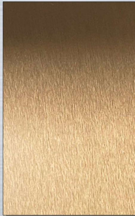
VC-37 No.4 Rose Gold+ shiny AFP