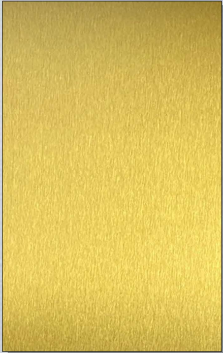
VC-45 No.4 Brass+Shiny AFP