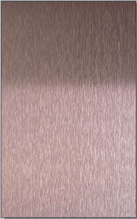
VC-39 No.4 Purple+Shiny AFP