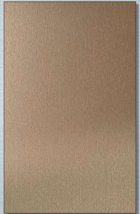
VC-38 No.4 Copper+Shiny AFP