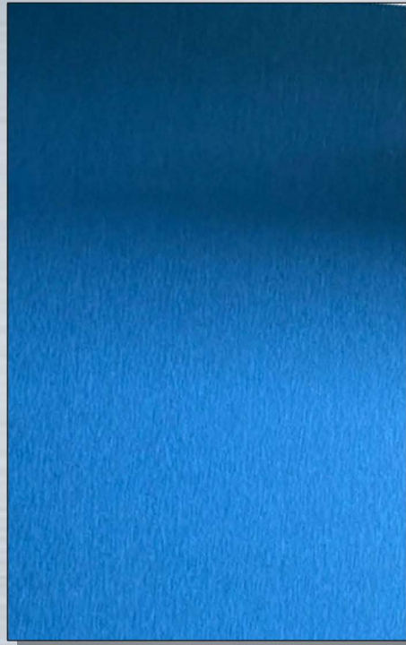
VC-40 No.4 Blue+Shiny AFP