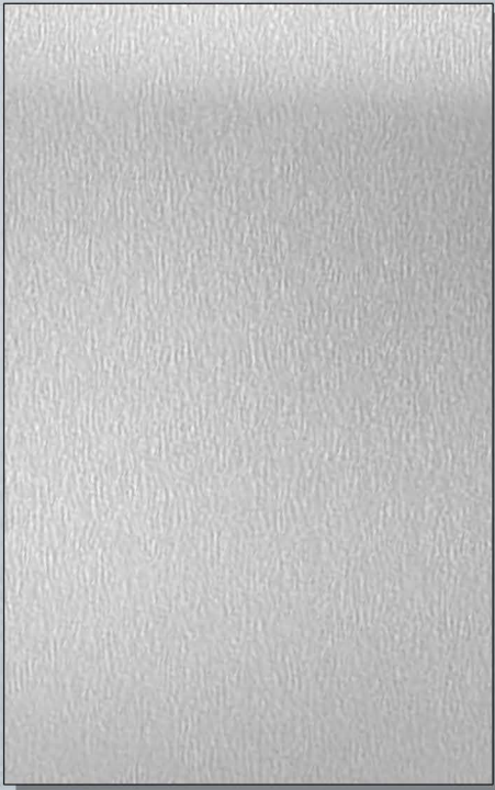
VC-33 No.4 Silver+Shiny AFP