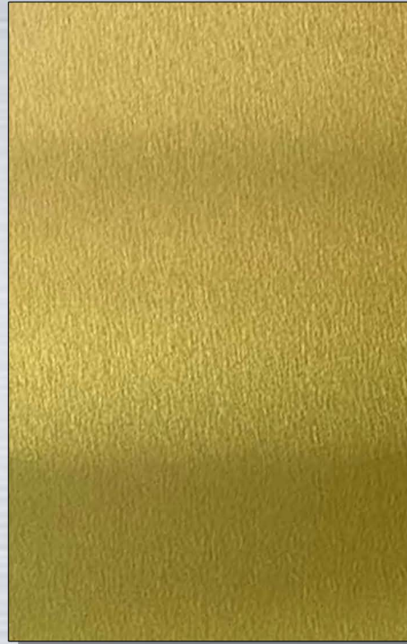
VC-46 No.4 K-Gold+Shiny AFP