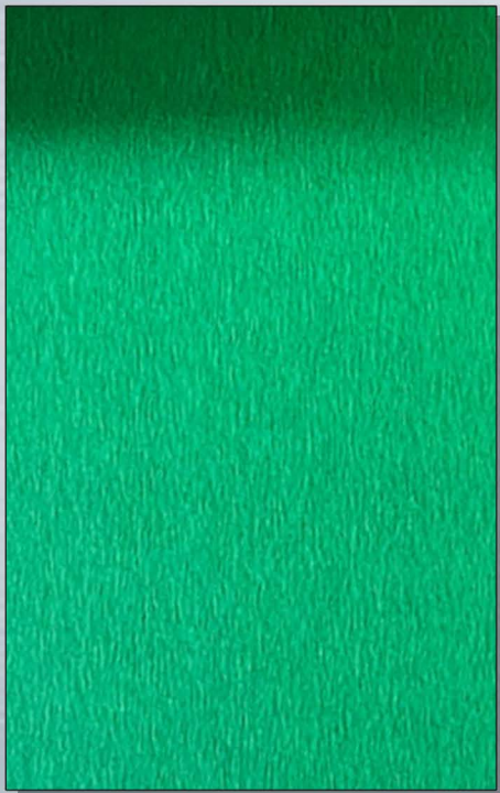
VC-42 No.4 Green+Shiny AFP