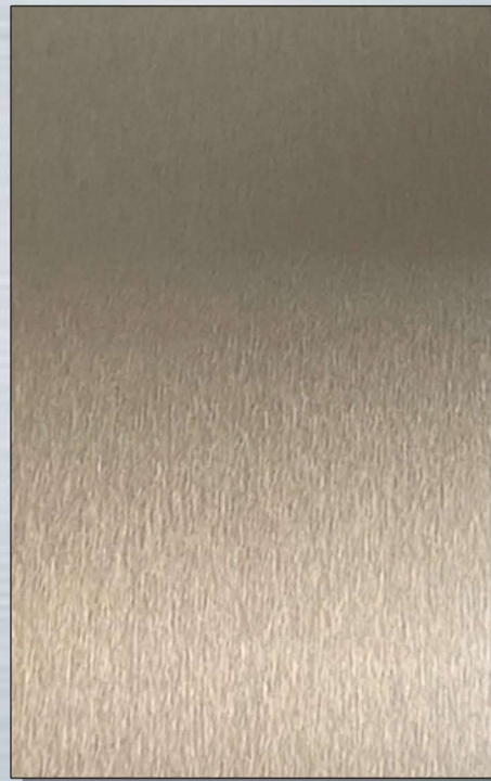
VC-43 No.4 Tea Gold+Shiny AFP